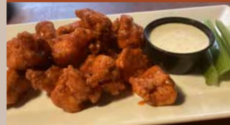
BONELESS BUFFALO WINGS