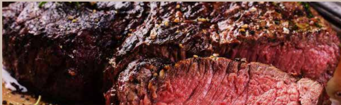
TAP HOUSE RIB-EYE

10 oz. steak topped with everything but the kitchen sink: crispy bacon, grilled onions, mushrooms, two cheeses, diced tomato, green peppers and jalapeños - 20.99