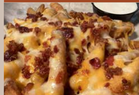
LOADED PUB FRIES